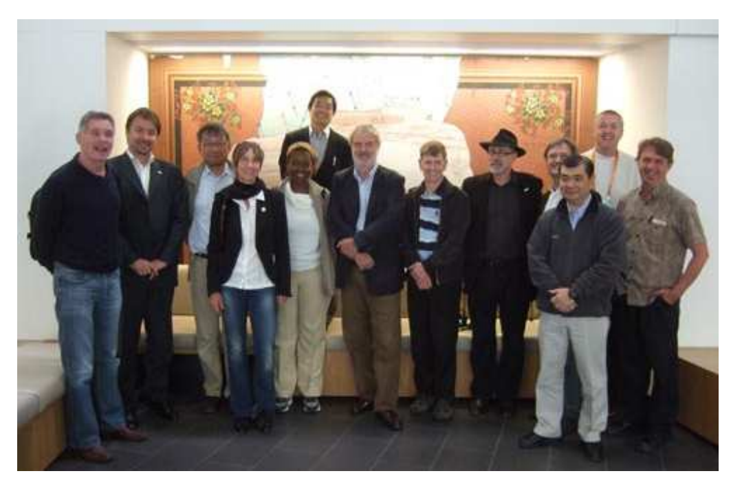
The old and the new CGI Council in Brisbane, Australia 2012.

The annual meeting of the CGI Council took place on 11. August just after the International Geological Congress in Brisbane.