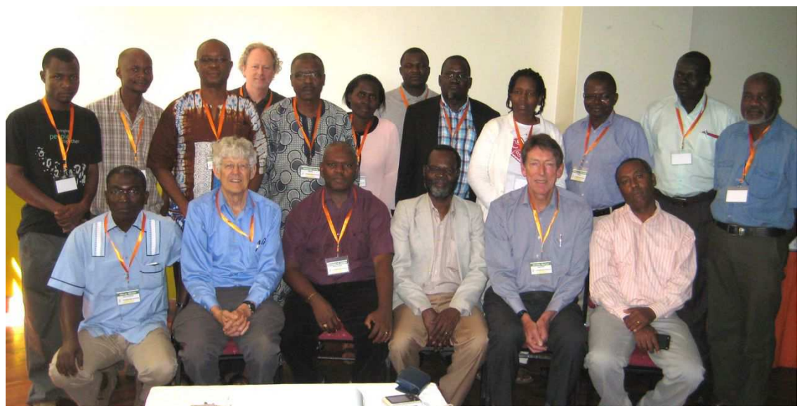
Participants of the eGY Africa Workshop held in Nairobi, 2012

The workshop brought together scientists and teachers who share a common desire to improve internet access in research and education institutions in Africa. 27 participants from 15 countries took part in the workshop.